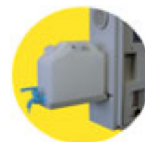
Reagent bottle tray for calibration (standard)